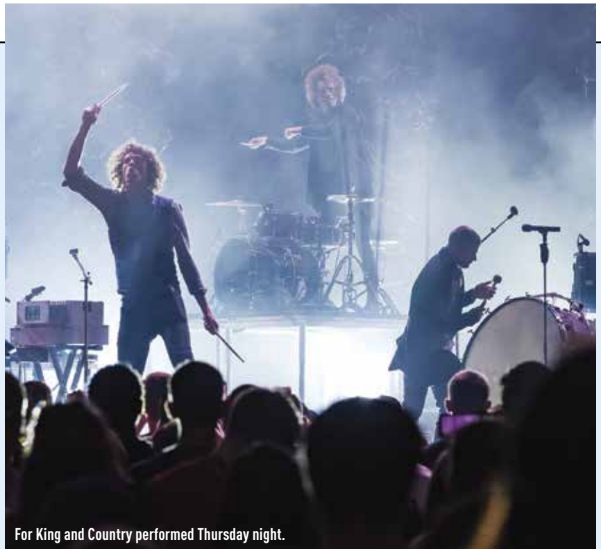
For King and Country performed Thursday night.

OFFERING: $109,230. The goal was $90,000. The average was split between the convention and the Kairos Benevolence Fund to support ministers in need.